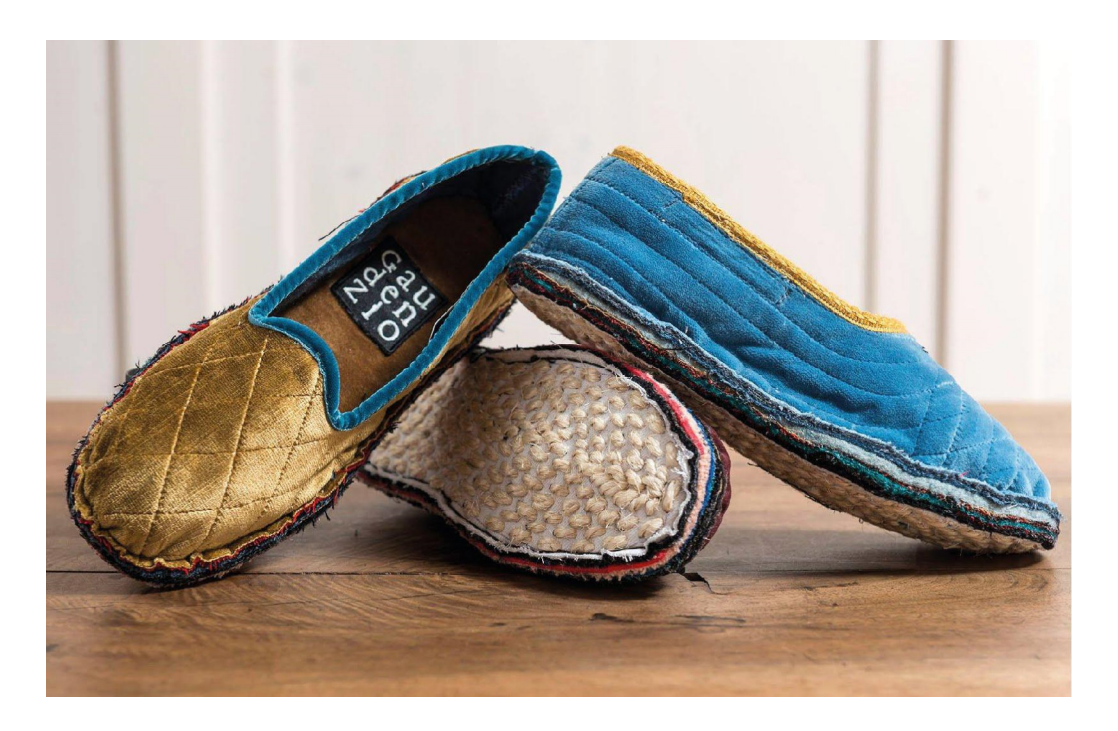
Fig. 3. Scapin, a traditional footwear from Valsesia (northern Italy), made by skilled craftsmen in a special limited edition. Reprinted from "Design strategies for enhancing territorial legacy. The case study of a diffused art exhibition to revitalize specific territories in Piedmont region - Italy", by Menzardi, P., Peruccio, P. P., & Vrenna, M., 2018, EURAU18 Alicante: Retroactive Research: Congress Proceedings, p. 450. Copyright 2018 by Moresco Cashmere.

historic cities, and literary works. Rural areas offer fascinating natural landscapes such as parks, forests, mountains, beaches, and hilly areas, many of them being protected. These natural wonders attract visitors from all over the world and create a prosperous economy based on tourism, catering, and leisure activities, as well as on environmental protection. In some areas, small local craft activities are still thriving economically, due to the quality products that are created with centuries-old techniques by master craftsmen (Menzardi, Peruccio, & Vrenna, 2018) (Fig. 3). Nonetheless, this sector is affected by globalisation that has delocalized many production chains, but also by profound changes in the usage and consumption habits of modern societies.